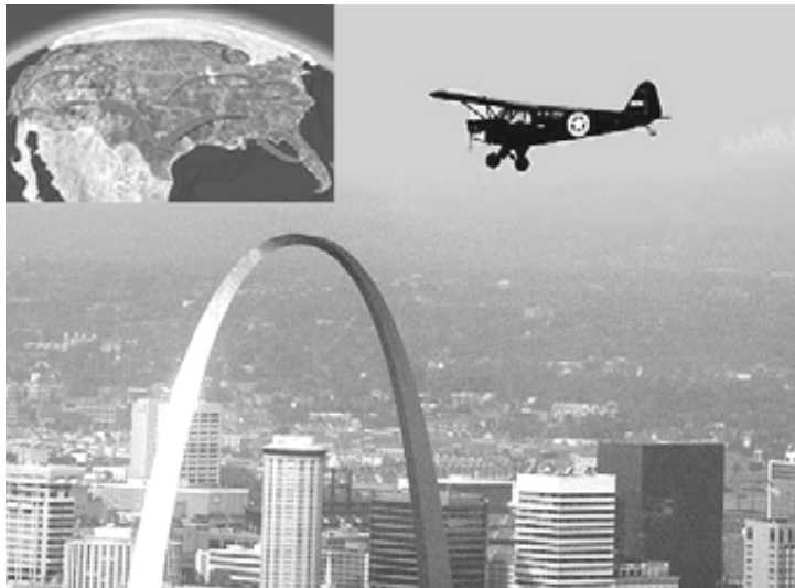
Piper L-4 "Grasshopper" WWII Spotter Plane Over the Gateway Arch